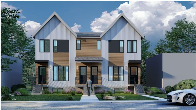
PROPOSED MULTI-FAMILY DEVELOPMENT ISSUED FOR DEVELOPMENT PERMIT

Enhance your real estate portfolio with this premier new construction rental development in Capitol Hill, one of Calgary’s most desirable inner-city communities. Scheduled for completion in the end of 2026, this purpose-built investment property consists of two buildings featuring a total of eight rental suites. Each building includes a spacious upper unit with three bedrooms and 2.5 bathrooms, as well as a well-appointed lower unit offering one bedroom with kitchen and full bathroom. A four-car detached garage with lane access provides added convenience and tenant appeal. Strategically located near downtown Calgary, 17th Avenue, parks, transit, and shopping, the property is ideally positioned to attract quality tenants and command above-average rents. Investors will appreciate the thoughtful design, superior construction, and long-term rental potential of these townhomes. The development is distinguished by its low-maintenance Hardy board exterior, high-efficiency HVAC systems, and durable finishes throughout—ensuring reduced operating costs and long-term durability. These modern, well-designed units are tailor-made for consistent cash flow and minimal upkeep. With estimated rents of $2,850 for upper suites and $1,450 for lower units Whether you're a seasoned investor or looking to diversify your holdings, this exceptional income-generating property offers the perfect blend of location, quality, and financial performance. For more information,